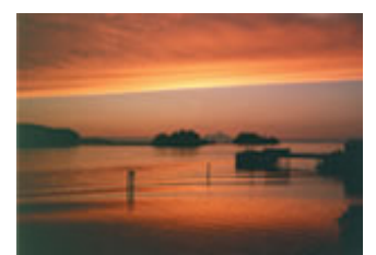
This is the view from a suite!