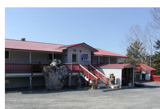
Spacious & Bright Living!

Here is a sample of some of the amazing properties available in Seldovia! (click on images below)