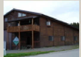
$549K Business Opportunity