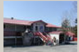
$298.5k, beauty, city, 1/2 acre