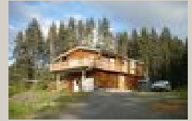
$249k 5 Star home in Seldovia