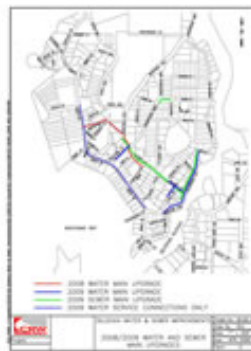
City of Seldovia, Alaska SELDOVIA WATER SEWER IMPROVEMENTS Anticipated 2009 Construction Schedule