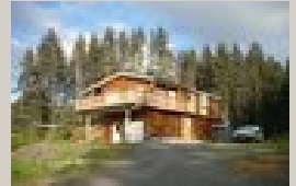
$249k 5 Star home in Seldovia