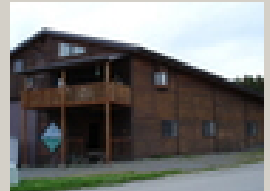
$549K Business Opportunity