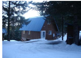
Cabin with a View!