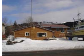
Main Street Opportunity