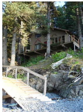
Oyster Cove Oasis

Give Jenny a call, she lives in Seldovia year round and is available to show ALL Seldovia listings - even on short notice! Visit Jenny's website to view current available properties in the Seldovia area!