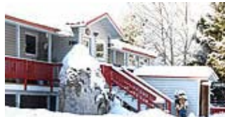
Beautiful 4 Bedroom 2 Bath

Lost & Found ad is a community service -- free listings to anyone! email your listing