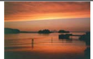
This is the view from your suite!