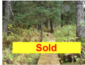
Almost 40 acres of wilderness