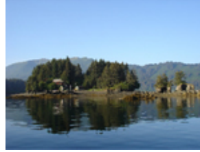
Seldovia Island Resort