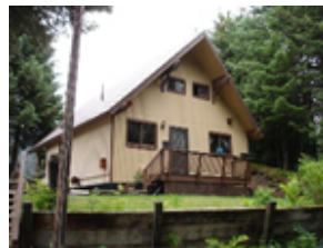
Cozy cabin on Lake Susan