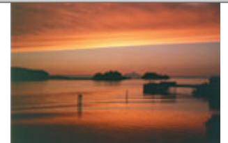
This is the view from your suite!