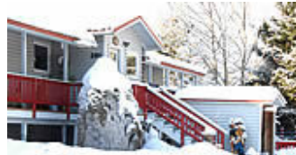
Beautiful 4 Bedroom 2 Bath

Lost & Found ad is a community service -- free listings to anyone! email your listing