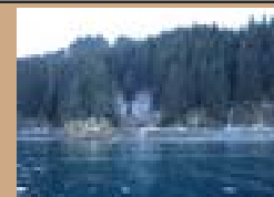
$375k 134acres on the water