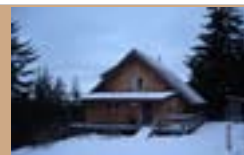
$170k Little house in woods

The vessel has been classified as a federal clean-up site and maybe accessed by authorized personnel only. The owner may assume the clean-up at any time by executing the Coast Guard initiated contract or entering into an equivalent contract with an approved response organization.