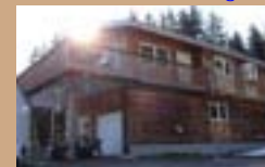
$259K 5 Star home in Seldovia