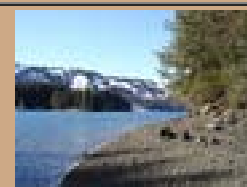
$75k Waterfront parcel

Click images below for info on each property