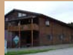
$549K Business Opportunity