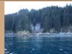
$375k 134acres on the water