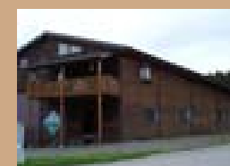
$549K Business Opportunity