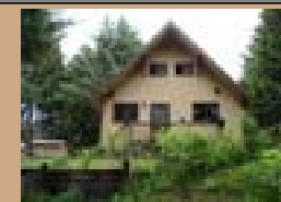
$198.5k Lakeside home Seld.