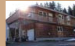
$259k 5 Star home in Seldovia