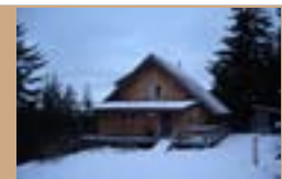
$170k Little house in woods