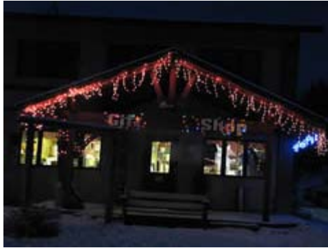
ATC Gift Shop