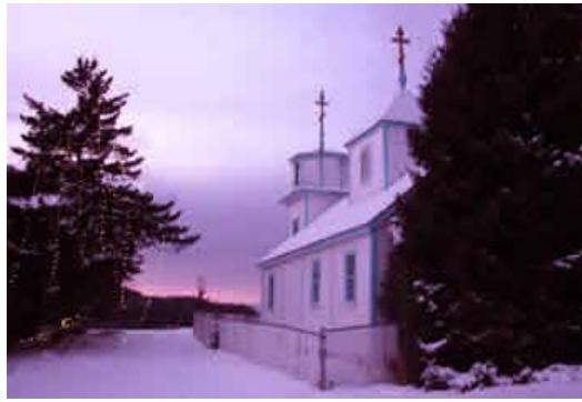
Second Place: Chamber of Commerce Christmas Tree