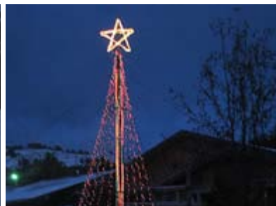
The whole town celebrates with the kids' as our main "stars..."

Seldovia Bible Chapel held their annual Christmas program last Sunday to opening piano students' festive songs which led to a nativity-themed program proclaiming the birth of our Lord and Savior Jesus Christ. With some "angelic" help, the night wrapped up with audience [participation] singing some tried and true hymns such as Joy to the World .