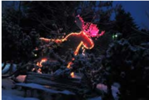
City display of deer and moose