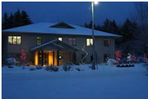
First Place: SVT Visitor Center