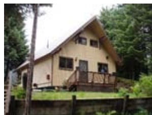
Cozy cabin on Lake Susan