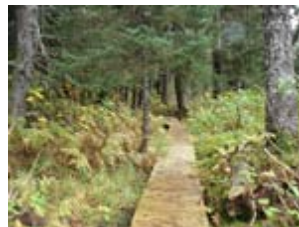
Almost 40 acres of wilderness