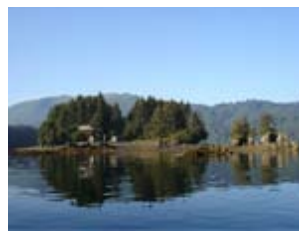
Seldovia Island Resort

246 Cedar Street House with 4 br, 1 ba, 1,404 sf. living area and a 10,890 sf. lot. Walking distance to downtown and small boat harbor. Now priced at $124,900