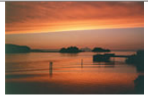
This is the view from your suite!

@ Re/Max Properties, Inc. 907-351-4794 or email: Alaskainvestments@gmail.com