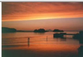
This is the view from your suite!

Seldovia Bayview Suites Spacious 4 Bdrm, 1&2 Bdrm Suites