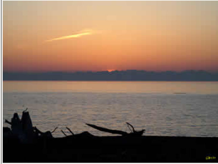
Sunset in Cook Inlet . . . summer is on the way.