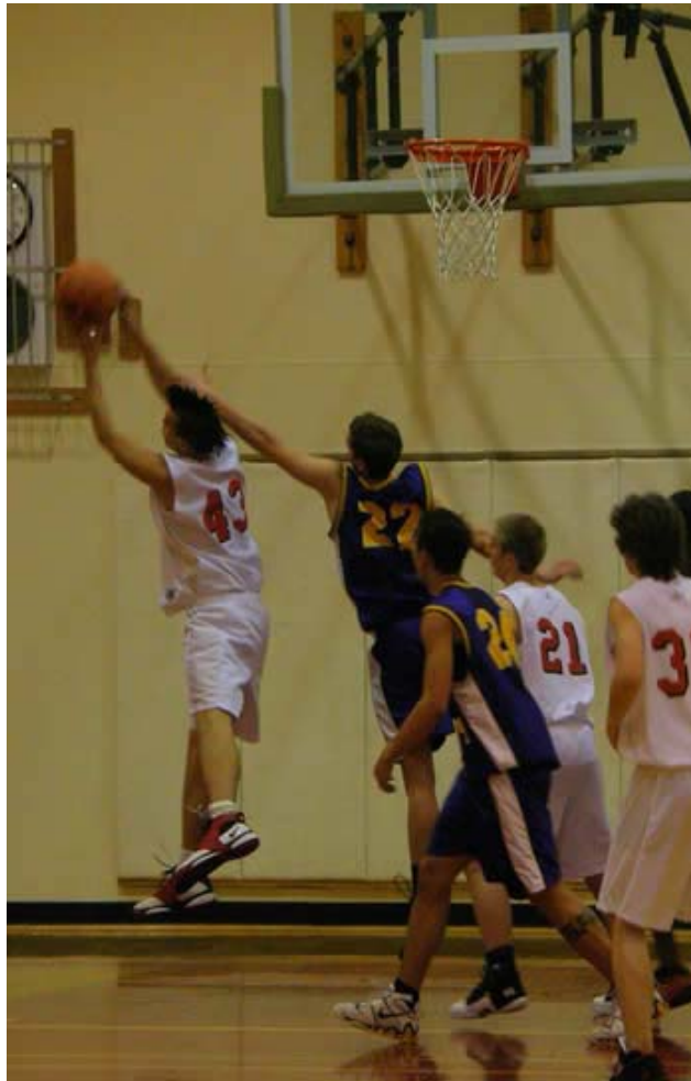
What a great play!

Copyright © 2008 Seldovia.com, Inc. and Seldovia Gazette. All rights reserved. The Seldovia Gazette is published weekly by Seldovia.com, Inc. Contents of this publication may not be used or reproduced, in whole or in part, in any form or manner without the express written permission of Seldovia.com, Inc. Click here for additional details.