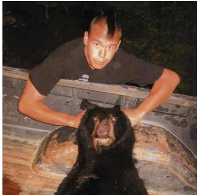
2007 Bear Kill