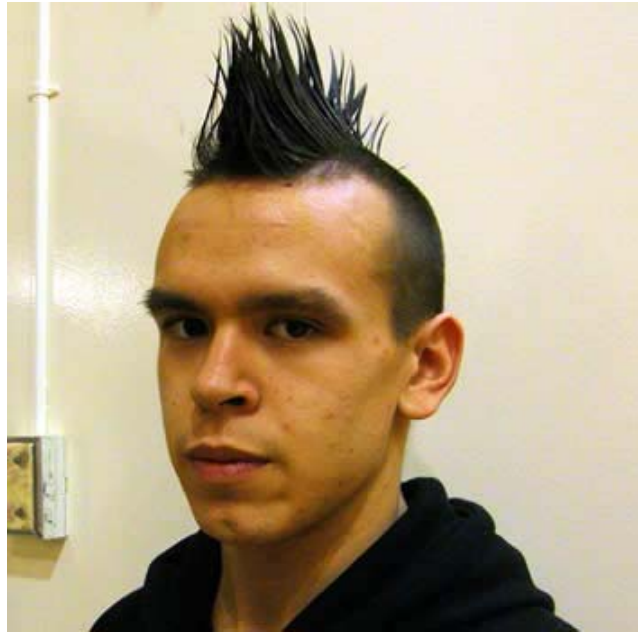
Page would not be complete without one of Levi's Mohawks!