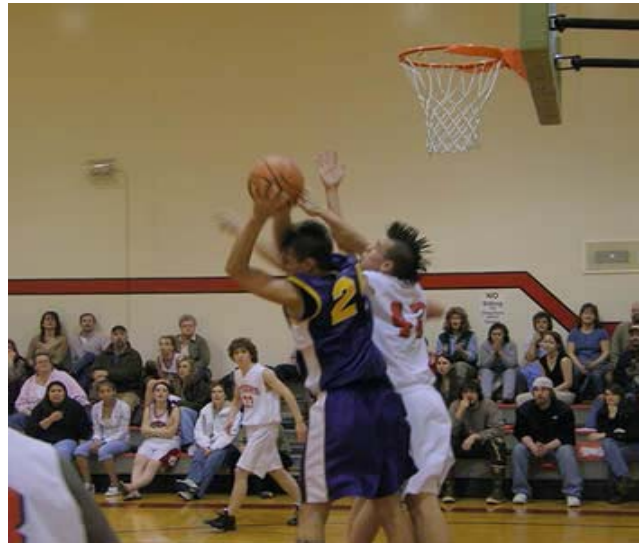
Playing well and hard at basketball