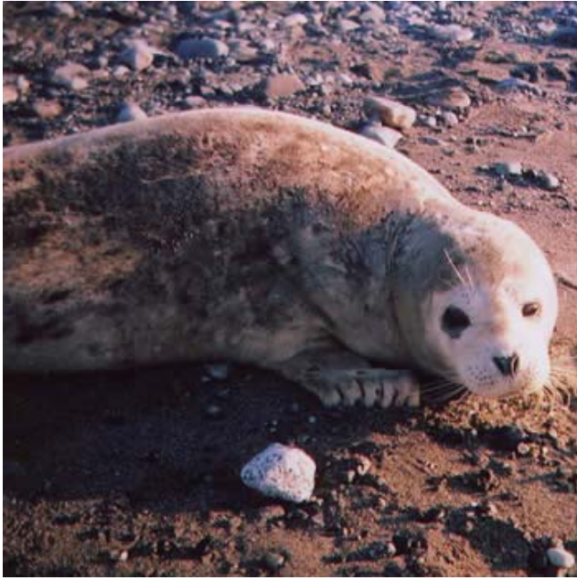
First seal kill