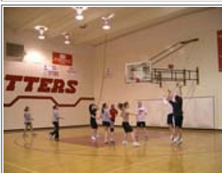
Another team having fun playing basketball