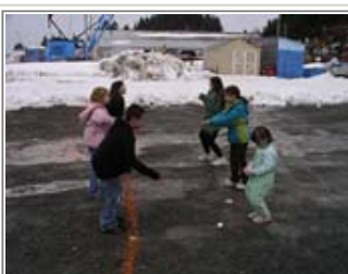
Parking Lot games for the whole family