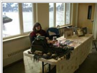
Crafts at the Conference Center