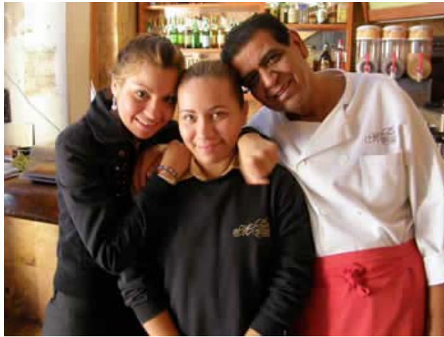
Apple for apple...

The current round trip non-stop airfare service from Alaska Airlines to Honolulu , HI is around $1300. Currently, there isn't non-stop travel to Mazatlan . One can make a single connection via Seattle , Arizona or LA for between $500-900 dollars roundtrip. The flight times are close, with approximately six hours in the air for a trip to Mazatlan one way and around six and half-hours to Honolulu . Flight time being equalized factors travel time out of consideration. Having just traveled with connections, the non-stop travel is appealing. However, upon arriving in Hawaii , the traveler would be rudely reminded that they had traded an equal cost of living for the Alaskan one left behind; the effective spending dollar remaining equal. In Mazatlan , a person can have the same, deliciously warm climate, with a huge decrease in cash outlay. Flights to Hawaii are more expensive but without the connection hassle, six of one, half dozen of the other. Having virtually the same climate with Mazatlan (23 degrees) and Honolulu (21). Both Mazatlan and Honolulu have dry winters and humid/rainy summers and early autumns.