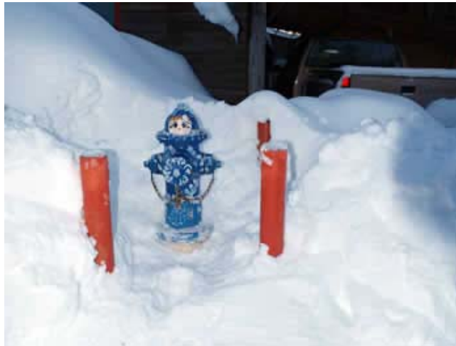
It only took 10 minutes to dig out this hydrant