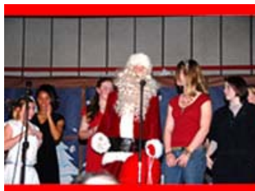
Photo Story SBE School Christmas Play Dec. 18, 2007