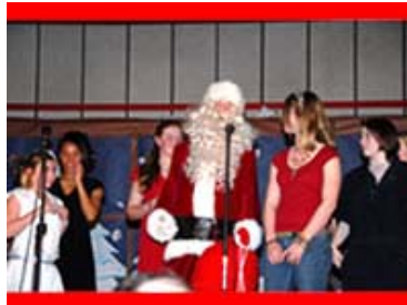
Photo Story SBE School Christmas Play Dec. 18, 2007