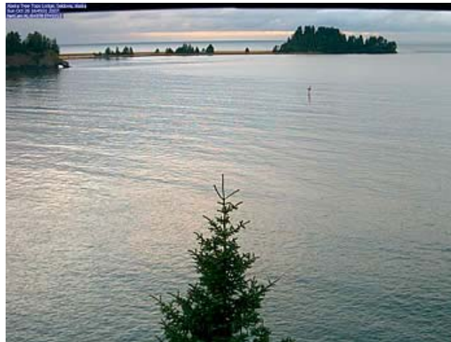
Seldovia Bay webcam at the Myers Alaska TreeTops Lodge Click image to view full size. Click image to view an annotated sample photo; click here to view the live image.

deck of their lodge, and captures a scenic view of Elephant Rock, Hoen's Lagoon, Naskowhak Point, the mouth of Seldovia Bay, and Mt. Iliamna (across Cook Inlet). Mt. Iliamna is not visible in the sample photo below due to clouds.