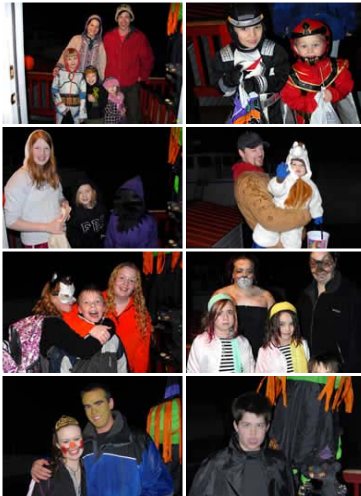
Seldovia Bible Chapel sponsored a Harvest Party early in the evening where the kids enjoyed games and good eats.