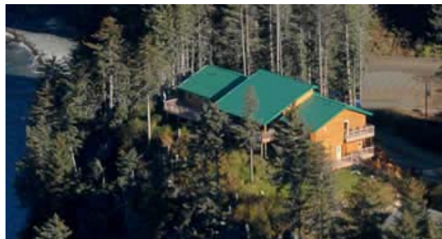
Alaska TreeTops Lodge, Seldovia, Alaska

The camera is a new generation NetCam XL 1.3 megapixel with auto-iris and produces a beautiful 1280x960 pixel image (if you have your monitor set to 800x600, that's 1.6 times the width of your screen.) The image is updated every 20 seconds and the auto-iris allows the camera to shoot good pictures in relatively low light.