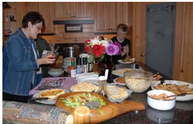
A scrumptious potluck buffet was served.