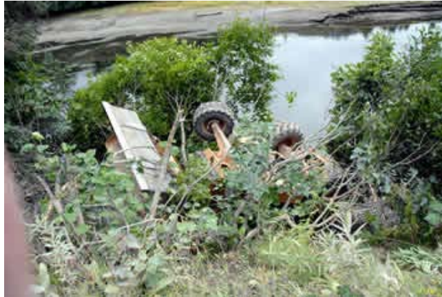
How do you rescue a rolled over Case backhoe?