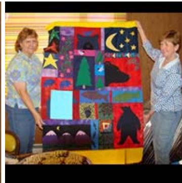
Quilt for raffle- proceeds to go for the funding of the Chainsaw Carving Contest

Other business of the day: Peggy Keesecker reported that many businesses in Seldovia are going to advertise in the Milepost 2008 issue. The body voted to donate $100 to help maintain the road to Red Mountain. The Chamber also voted to prepare a resolution to present to the City Council to rescind the ordinance concerning the recently imposed passenger port fee and visiting vessel fee. It was the Chamber's position that these two fees were detrimental to a healthy tourism economy. The Chamber also voted to participate in an Across the Bay Tour/Lunch on Sunday, September 30th. We will be entertaining people who are visiting the Homer Chamber and these are people who are travel agent, travel writers and hotel concierges. Tom Hopkin's vessel will bring this group from Homer to visit Seldovia. Barbara Carlough is the contact person for this event. The Chamber also plans to host a "Seldovia Night at the Movies" in the Chamber's location next to the post office. (Stay tuned for more information at a later date.) Proceeds will go towards funding the Chainsaw Carving Contest.