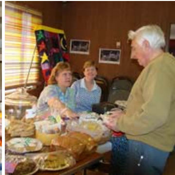
Bake sale on Labor Day Weekend