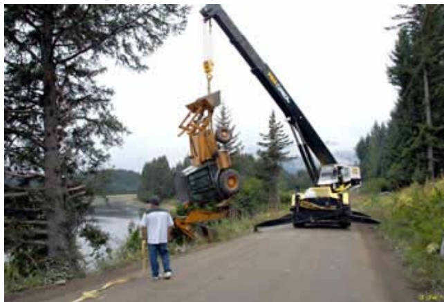
Gently lift that 10,000 pounder up to the roadway . . .