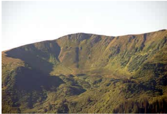
And the snow bowl is empty!