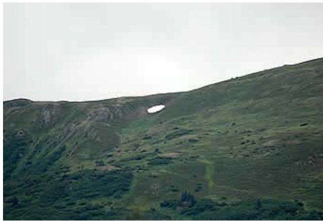
Above photo was taken Sunday morning, August 19