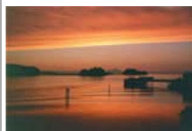
This is the view from your suite!

Seldovia Bayview Suites Spacious 4 Bdrm, 1&2