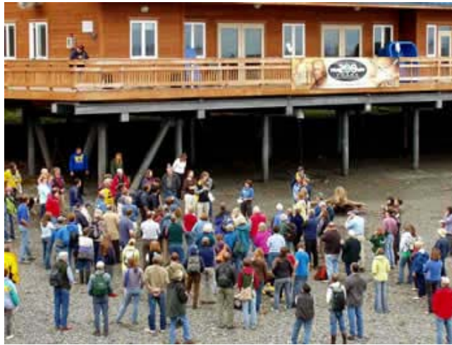
Attendance at the open house and ceremony was great!

It was a great celebration. Activities included fish painting for kids of all ages, tours of the facility, and a chance to build your own remotely operated vehicle (a water "robot") and then test it off the dock. Some creative robot designers even had their vehicles doing somersaults in the water. A great lunch for all was sponsored by I.M. Systems Group.