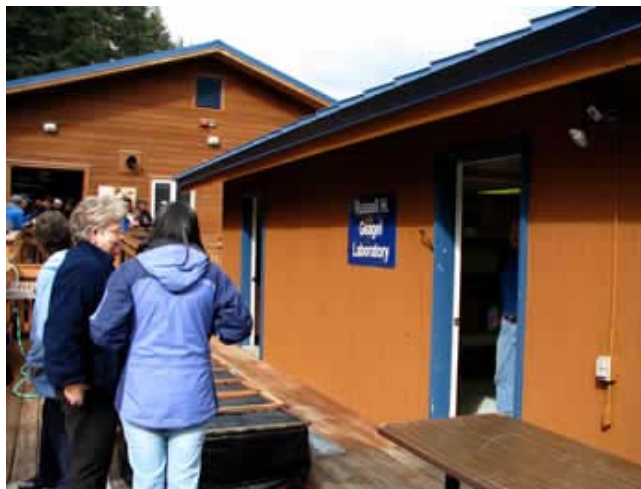
Russell H. Geagel Lab building.