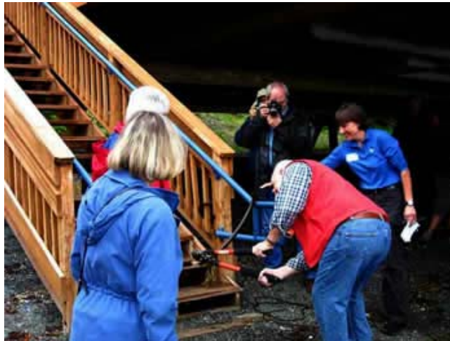
Kelp cutting ceremony.