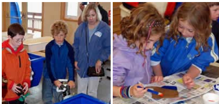
Kids had a great time too!

Having a Laboratory of this caliber within eight miles of Seldovia should be a boon to all. They have educational classes and different research projects which could prove valuable to our citizenry. There are new dormitories, and the chance to work both in wet and dry laboratories as well as the surrounding waters. The Laboratory works with partners to host classes for school kids, as well as undergraduate and graduate students and is looking to increase educational opportunities for students from Seldovia and the other local communities. Students would take advantage of the proximity of this great resource, and utilize the opportunity to gain knowledge about our marine environment.