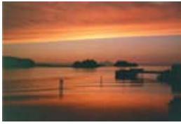
This is the view from your suite!