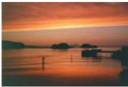
This is the view from your suite!