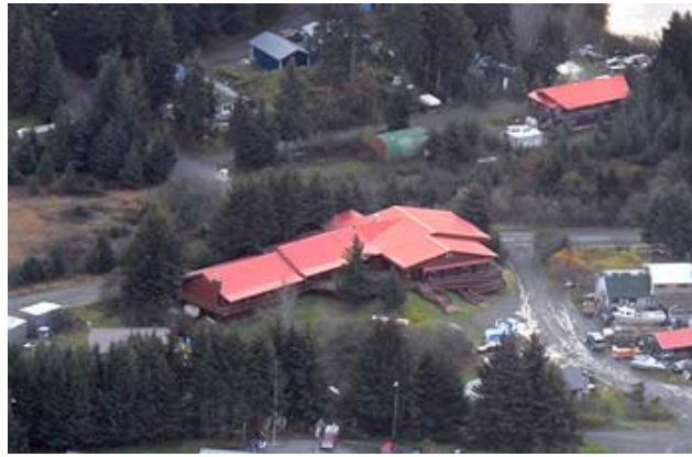
Seldovia Lodge, October 2005