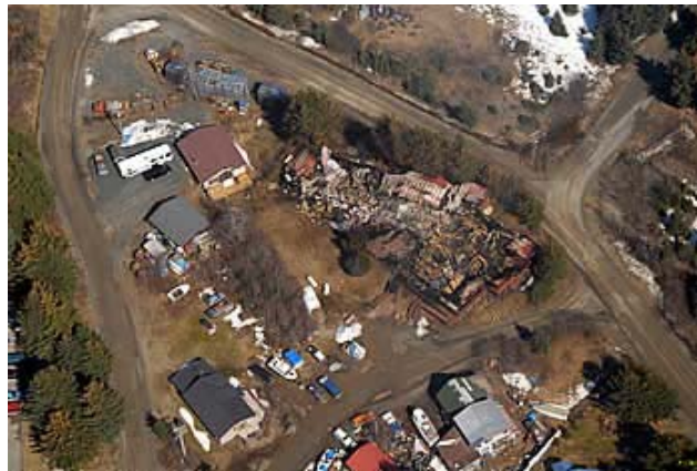
Seldovia Lodge fire aftermath, May 3, 2007

Click here for a PhotoStory of the Seldovia Lodge fire