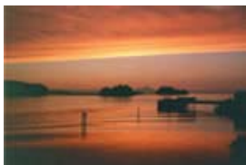
This is the view from your suite!

Seldovia Bayview Suites Spacious 4 Bdrm, 1&2 Bdrm Suites