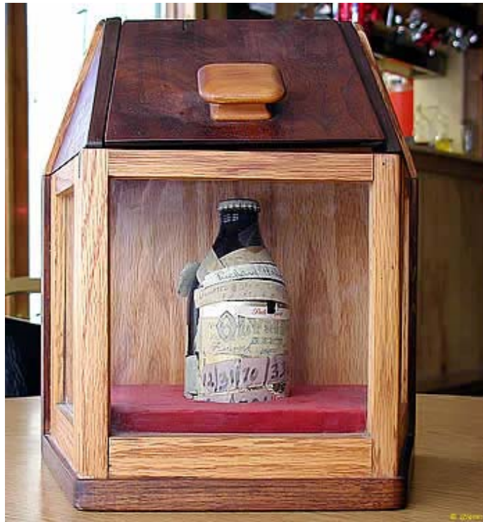
Seldovia's famous "Oly" Bottle

The old "Oly" bottle will be auctioned off again this year (this bottle dates from the 50's). A silent auction will take place throughout the afternoon for people that wish to place their bid(s) on items. They may do so by writing down their name and bid amount on the accompanying paper for that item. Every local business in town donated items for the auction as well as some Homer businesses patronized by Seldovians.