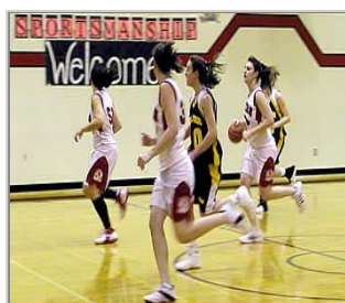
PhotoStory Sea Otters last home game of the season