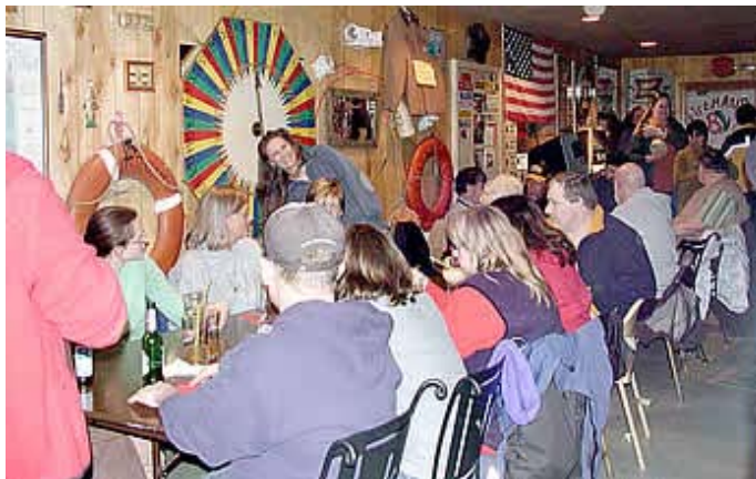
Last year's Fireman's Ball