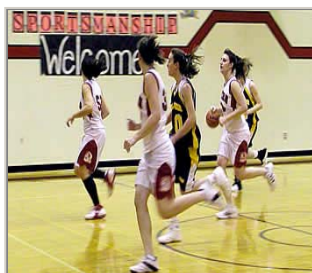
PhotoStory Sea Otters last home game of the season