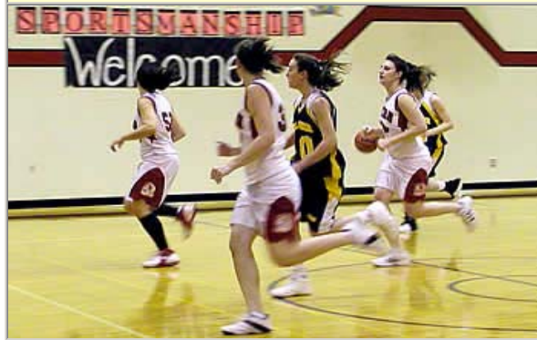
PhotoStory: Sea Otters last home game of the season