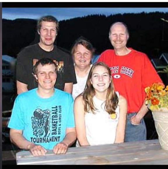
Current Family Photo