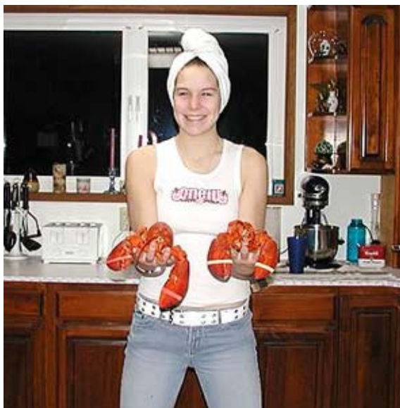
Lobster in Seldovia?