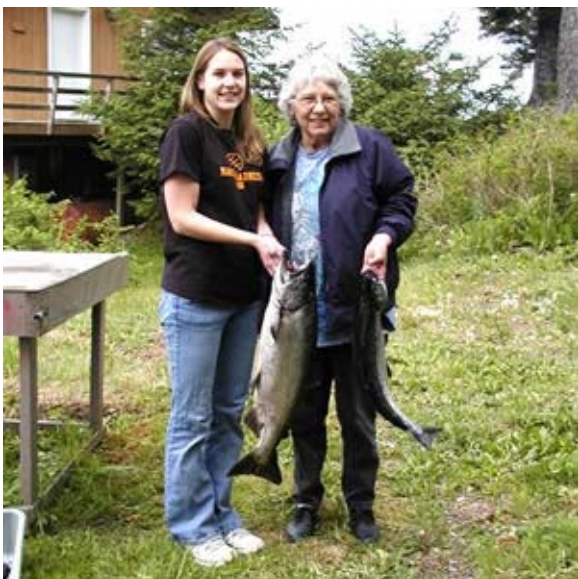
Caught a King!