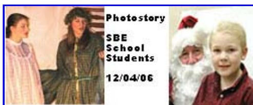
Photostory SBE School Students 12/04/06