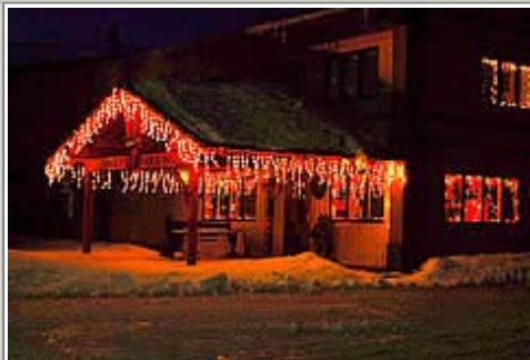
1st Place ATC building (next to store)