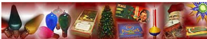
Historical presentation of Christmas lights and music and graphics.

Today, the internet is the information source. Knowledge is increasing at an amazing rate partly due to the information available to all of us. During this Christmas season, we will try to bring you some interesting web sites to visit to enhance your enjoyment of the season. (If you, as a reader, would like to share a favorite website with us, just email us your information.) This week's choice is: The Antique Christmas Lights Museum