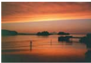
This is the view from your suite!

Seldovia Bayview Suites Spacious 4 Bdrm, 1&2 Bdrm Suites