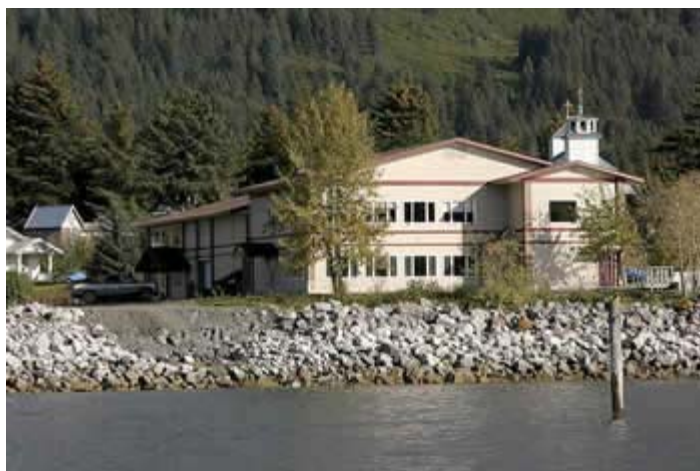
Seldovia Tribal Conference Center

The Kachemak Bay Research Reserve Community Council held its 3rd quarter meeting in Seldovia on Wednesday, September 20th at the Seldovia Tribal Conference Center . The Reserve traditionally holds its fall meeting on the south side of the Kachemak Bay.