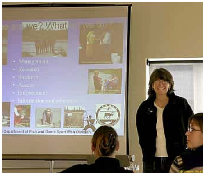
Alaska Department of Fish & Game presentation