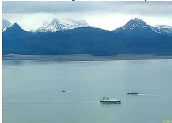
The Tustumena heading to Seldovia on Tuesday