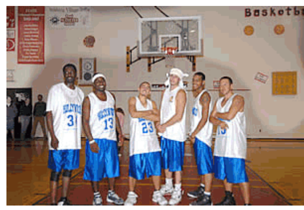
Shot taken just after the Slam Dunk Champion exploded the backboard

Team Hollywood is a celebrity basketball team that has a rotating roster of players that have a variety of backgrounds in the NBA, WBNA, Harlem Globetrotters, college basketball champions, professional streetball, television, movies and even modeling.