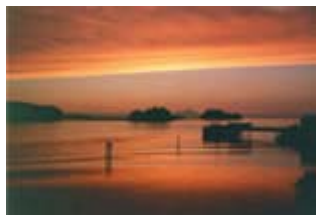
This is the view from your suite!

Seldovia Bayview Suites Spacious 4 Bdrm, 1&2 Bdrm Suites