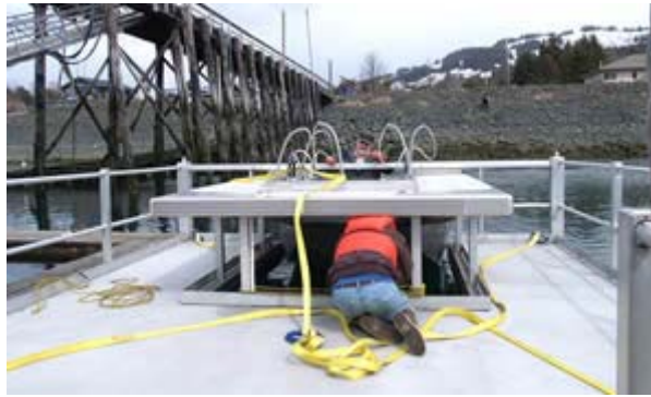
Seldovia's new fish cleaning station is home!