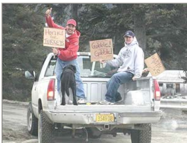
A few local supporters of the turkeys decided to go out and make their feelings known on Thursday.

OK folks, here is the scoop on the turkeys! The turkeys are starting to cause a public nuisance. By definition, a nuisance is defined as "a use of property or course of conduct that interferes with the legal rights of others by causing damage, annoyance, or inconvenience."