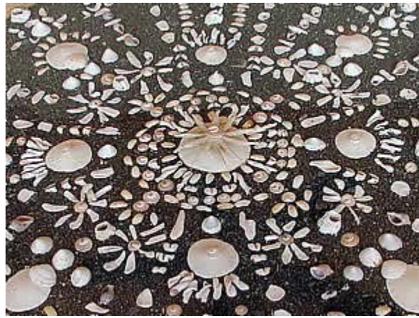
Tidepool Restaurant table tops