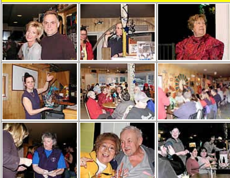
Click images to view full size