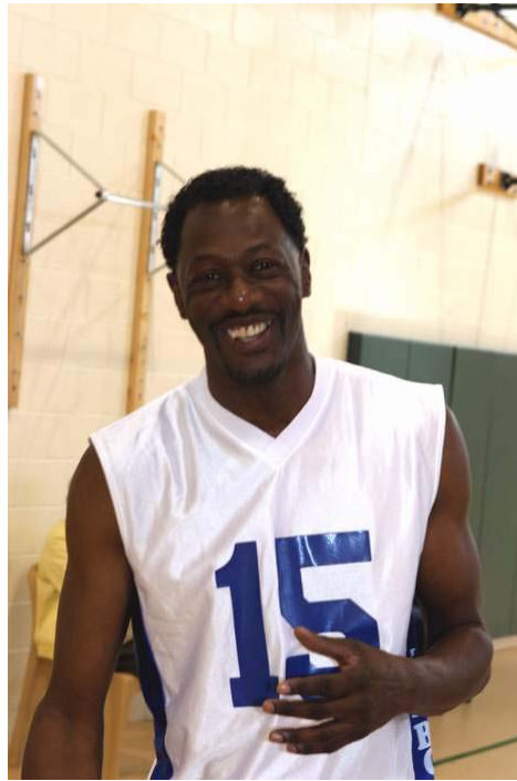
Photo link to Tornado Alley