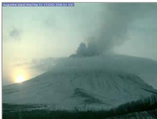
AVO's Augustine Island webcam caught this sunset on March 1, 2006.

Unrest continues at Augustine Volcano. Over the past 24 hours [Wednesday, March 1], a slight increase in volcano-tectonic earthquakes has occurred, although seismicity remains relatively low. Small rock avalanches from the lava dome and summit area are being recorded intermittently on all seismic stations. GPS instruments are measuring renewed inflation of the volcano. Satellite images show persistent thermal anomalies and low-light camera data indicate strong incandescence at the summit. An overflight of the volcano yesterday allowed AVO staff to observe the lava dome and a short, stubby lava flow that extends to the northeast, terminating at an altitude of about 3000 ft (915 m). Sulfur dioxide emission rates measured on February 24 and March 1 are significantly lower than those measured in January and earlier in February. AVO staff who visited the island yesterday retrieved GPS and seismic data that will assist in interpreting the present state of unrest.