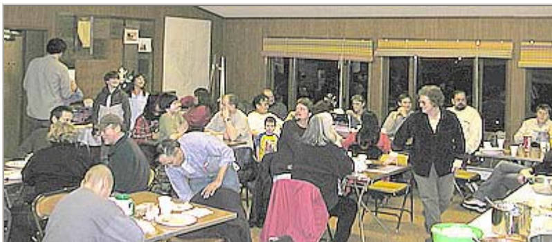
It was standing room only this year . . . come join the fun next year!

Last Thursday SOS put on a wonderful, community potluck on February 16th. This event was so well-attended that there were hardly enough chairs for the people! Everyone got a chance to visit and had a sampling from a well-balanced array of foods and desserts, with fresh coffee and punch available to drink as well.