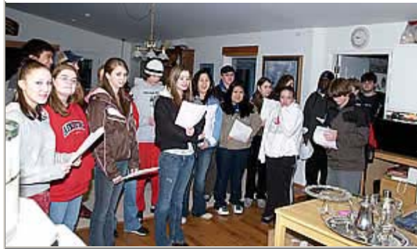
The SBE Chorus Troop also made it out to a few homes before school. What a great group of kids!