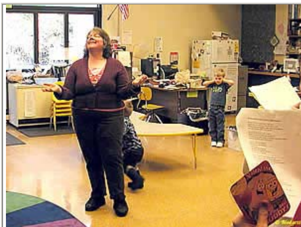
For some, listening to the choir practice is music to your ears . . . but as you can see, that's not a universal opinion.