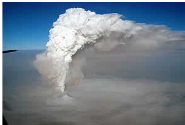
Augustine volcano, January 30.

Seismic data indicate that eruptive activity continues intermittently and has changed little in character or intensity over the past few days. Thursday's satellite imagery indicates that the continuous ash plume is extending east-southeast at an altitude below 11,000 ft. Eruptive activity is characterized by low-level explosions, pyroclastic flows, and sustained production of ash. The Level of Concern was lowered to Orange on February 1 although volcano is still very active.