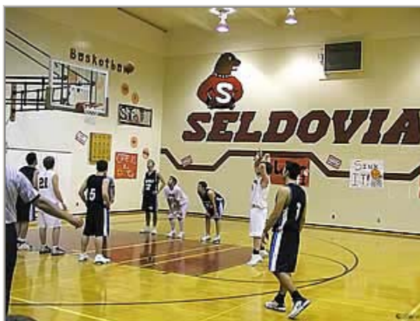
The winning shot for the Seldovia boys team in their drive to glory. What a great game!