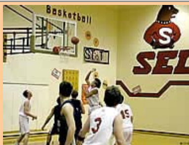
Boys Team Seldovia 63 - CIA 62

Friday nights games with Seldovia vs. CIA were great fun , lots of action and Seldovia won both the boys and girls games. Congrats to the kids and their coaches!