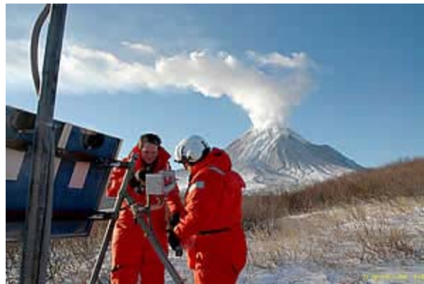
Augustine volcano, January 24. Repairs to the island webcam have been completed.

Seismicity at Augustine Volcano increased slightly Wednesday night and again Thursday afternoon. Satellite observations indicate that faint thermal anomalies persist at the volcano.