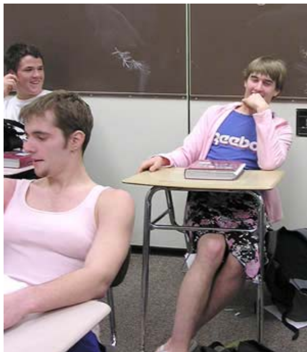
Opposites Day