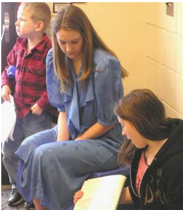
Dress like the "Older" Generation Day