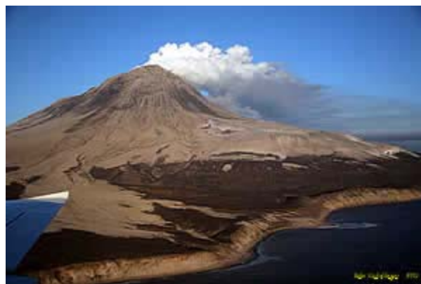
Augustine volcano, January 18.